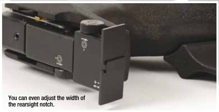
You can even adjust the width of the rearsight notch.