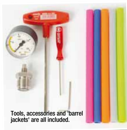
Tools, accessories and 'barrel jackets' are all included.

I have to confess that I wasn't inclined to give the test pistol a day-glo barrel, but it takes all sorts, I suppose. I couldn't find any technical reason for the jackets, so I guess they must just be for fun and that's fine of course.