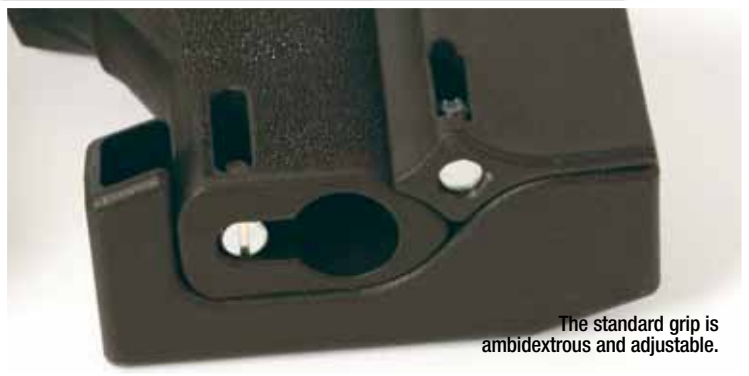
The standard grip is ambidextrous and adjustable.

Next month we'll continue this review with some feedback from competition shooters who'll give their impressions. ■